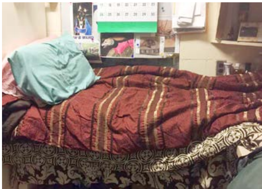
The Greyhounds' caretakers made their beds right alongside the hounds' crates as they waited for Hurricane Irma to pass.

As Hurricane Irma approached, the dogs were exercised in sprint paths until conditions worsened. Daily routines were kept as normal as possible, including turn-outs and feeding schedules. They were in familiar surroundings with people they knew, loved, and trusted. Trainers, kennel owners, and kennel staff were there to maintain a calm environment, protect, and care for the dogs.