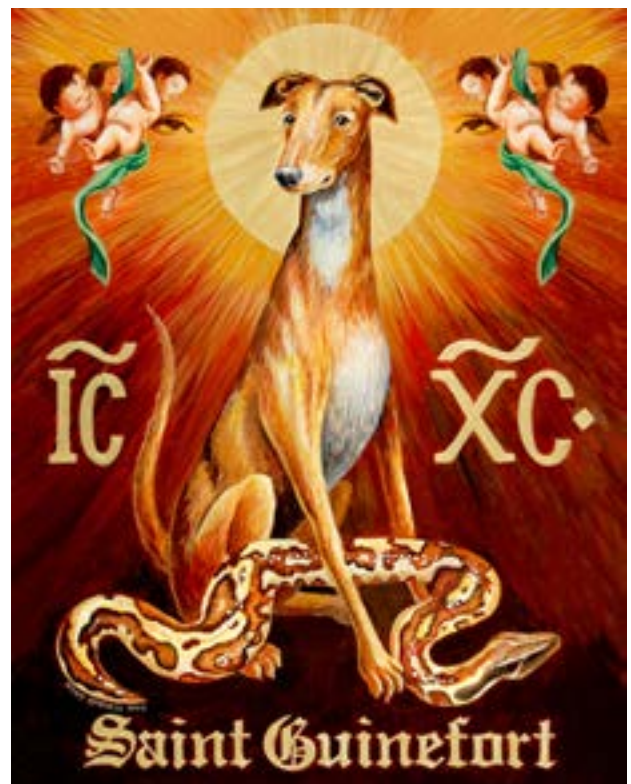
Kent Roberts created this oil painting of Guinefort.

When I first started in the magazine business, personal computers were just getting popular. Fresh out of college, I still wrote my articles on a yellow legal pad, then typed them up for publication later. We received press releases on a thermal